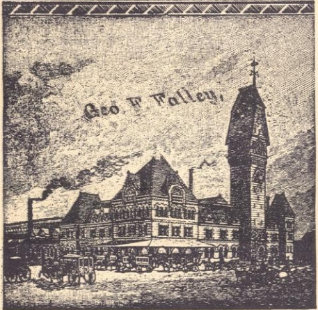
DEARBORN STATION—CHICAGO TERMINAL "MONON ROUTE." Polk Street, between Clark and State Streets.